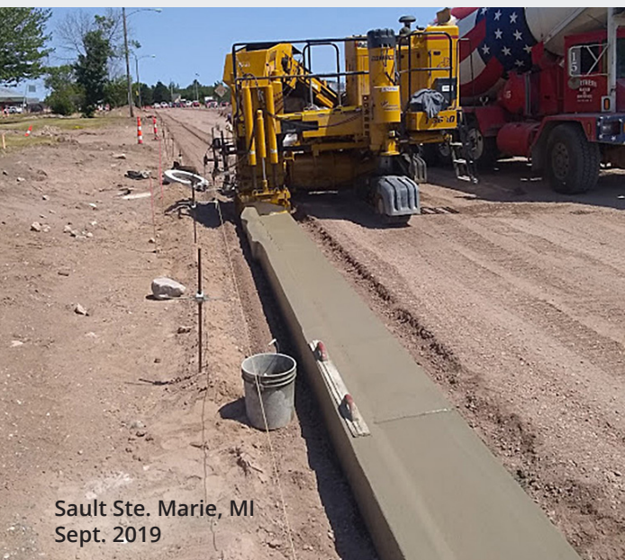
Sault Ste. Marie, MI Sept. 2019